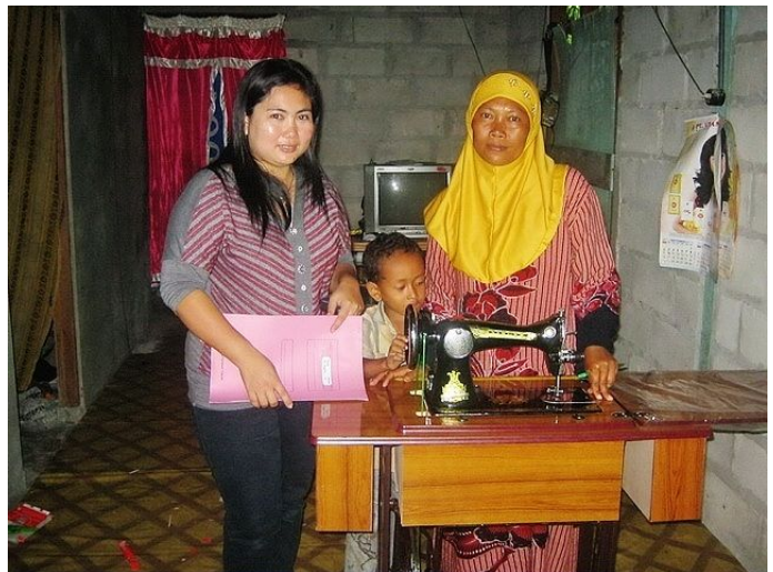
Above pictures show the handover of the sewing machines to the cooperative members.

As the cooperative is starting to run, the organization of the loan distribution has been clarified: Each member is allowed a Rp 1.200.000 loan from the KSU – Usaha Mulia cooperative, corresponding to the price of the sewing machine. It is planned that this loan should be paid back over a 10 months period, with an installment due every week. The cooperative members have started repaying the loan since the 2 nd of November. (For further details, please refer to the grids below) As the sewing training is going to welcome new trainees every 4 months, it is expected that these participants may join the cooperative. Therefore, the cooperative should greet around 24 women over the next 12 months. It is planned that one leader is elected for each group of 8 women, to ensure timely return of the loans. The members of the cooperative will also have to meet monthly so as to coordinate their progress.