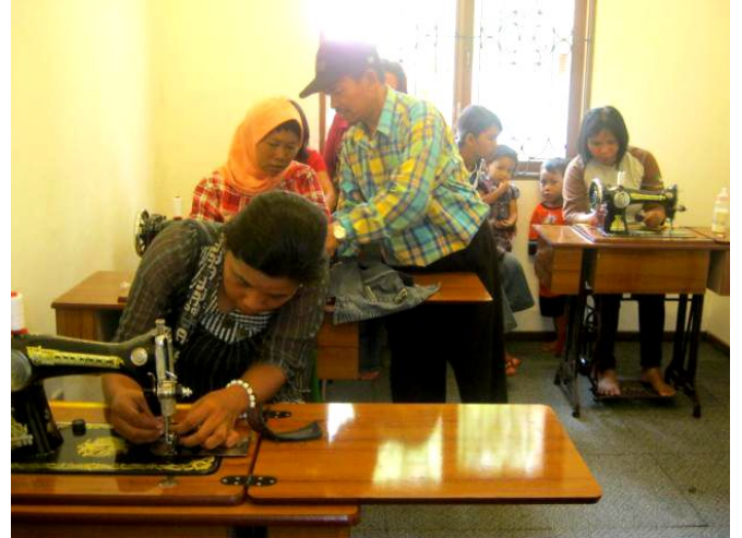
Above pictures show the sewing training participants at work and the trainer teaching them.

The progress of the YUM sewing project is very promising: Thanks to the support of the Social Services of Central Kalimantan province, a few YUM bags were exhibited in the JCC HKSJN Exhibition organized by the Department of Social Affairs in Jakarta, from September 27 th to October 30 th . YUM has also started to build a network of shops interested in selling the products made by the women. Cooperative members are therefore ensured a market to sell their personal creations, not only in the province but also in Jakarta and Sumatra.